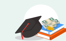
Student debt relief

On the other hand, employers find them to be a solution to absenteeism and presenteeism . Some examples include: